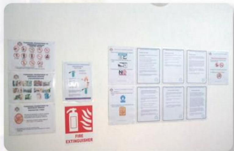
HOSTEL RULES & REGULATION