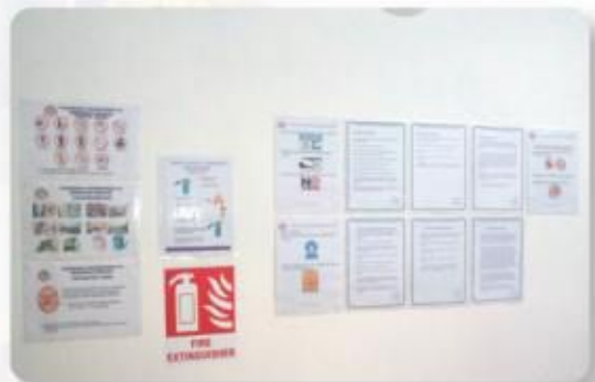
HOSTEL RULES & REGULATION